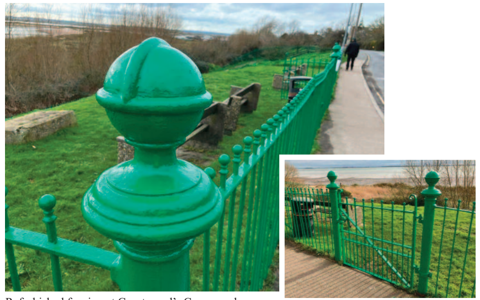
Refurbished fencing at Coastguard's Compound.