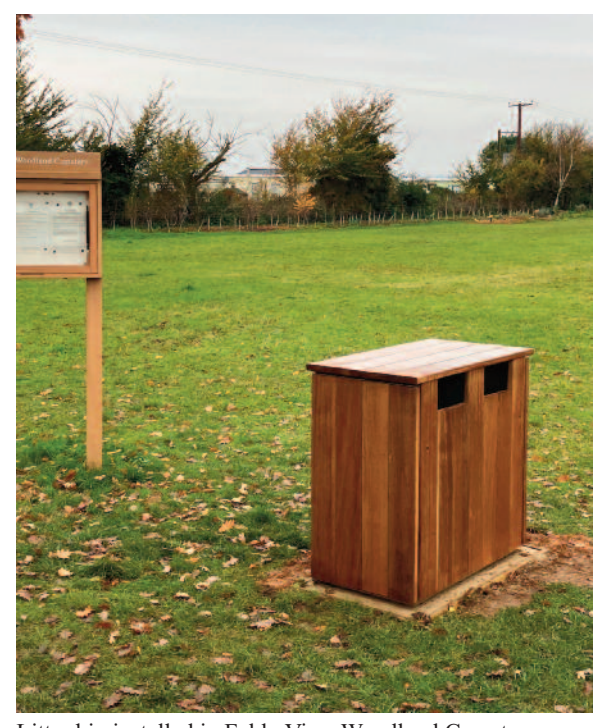
Litter bin installed in Feldy View Woodland Cemetery.